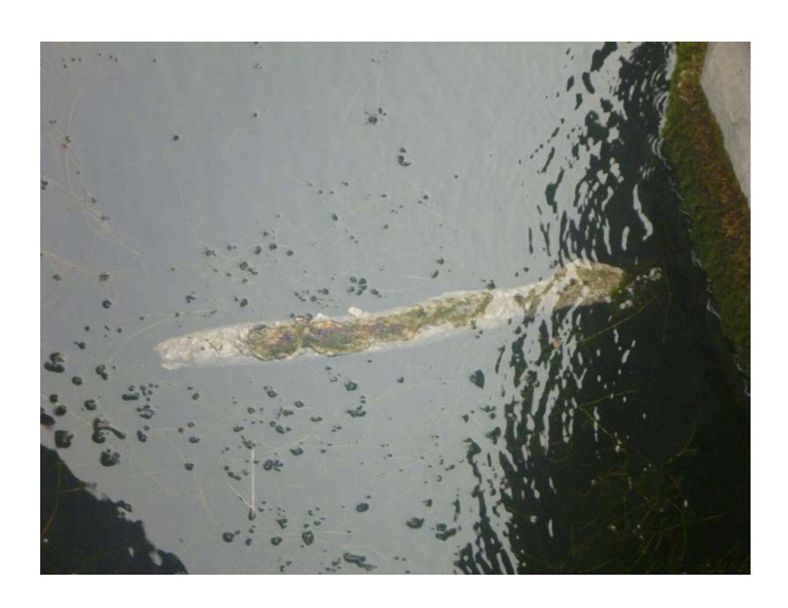
Sincerely, Project Fisheries